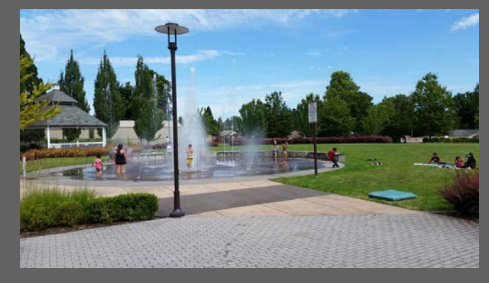
Splash Pad at Chalmers Jones Park

Keizer Bottom was the original settlement site on the banks of the Willamette, but floods destroyed homes and businesses. The community was rebuilt in the present site. The original site of Keizer Bottom is now a city park named Keizer Rapids Park and features a dog park, playground, and nature walking trails.